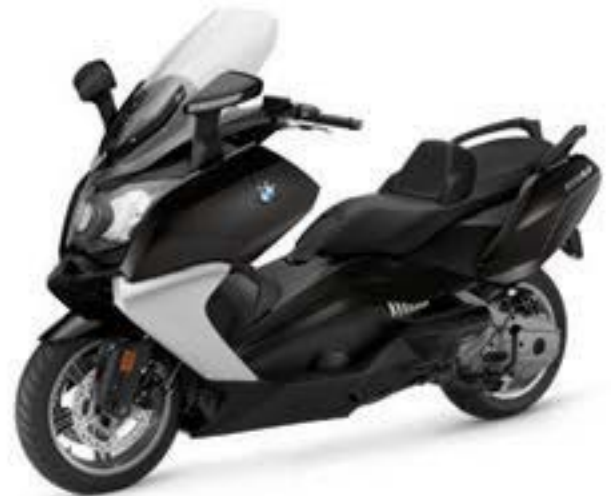
ND2 Paintwork in Black Storm Metallic/Seat in Black