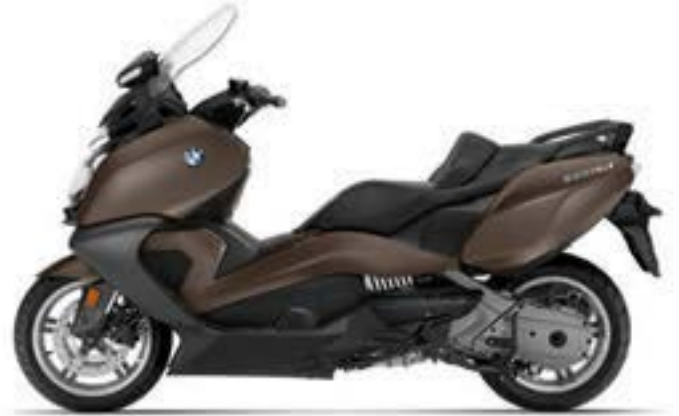
NOW Paintwork in Frozen Bronze Metallic/Seat in Black