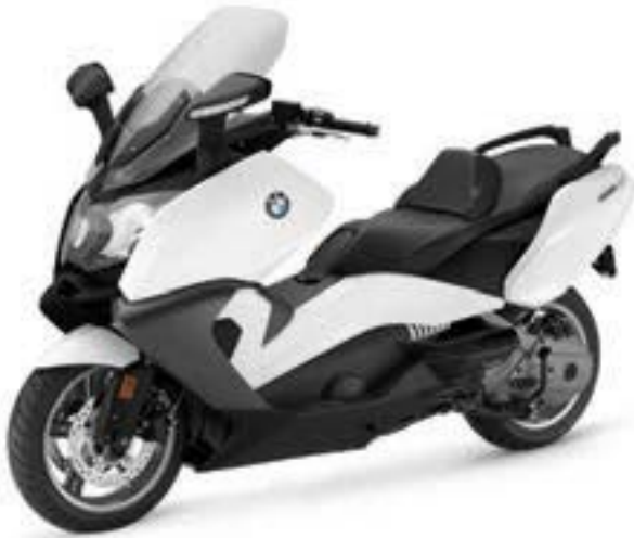
NB5 Paintwork in Light White/Seat in Black